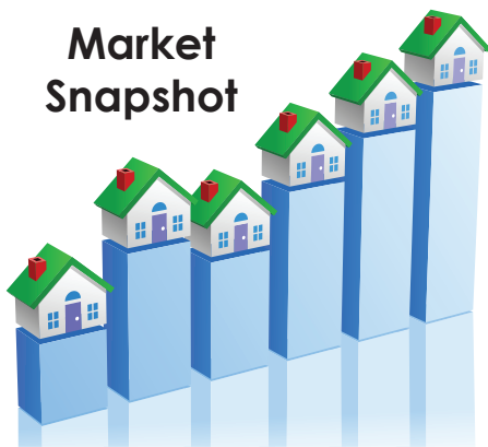
Sold Listings Comparison 2009 – 2010 - 2011

* Average DOM = Average Days on the Market **Percent of Original List Price Received ***Percent of Final List Price Received